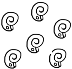
Shells pierced with a tool