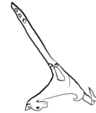
Atl-atl (spear thrower). Decorated with a fawn pooping.