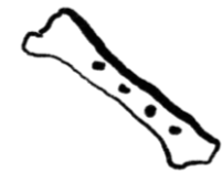
Bone with Holes