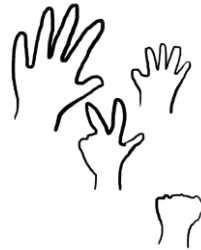
Hands of different sizes painted on the wall