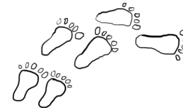
Small circle-shaped footprints