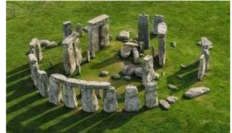
Stonehenge (United Kingdom)