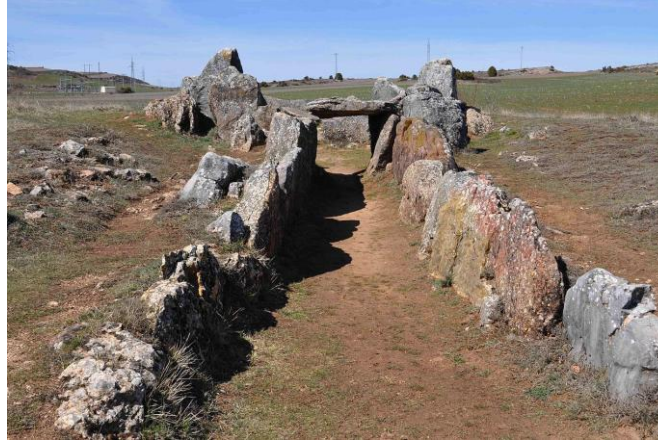
Dolmen of Cubillejo de Lara (Castilla y León)