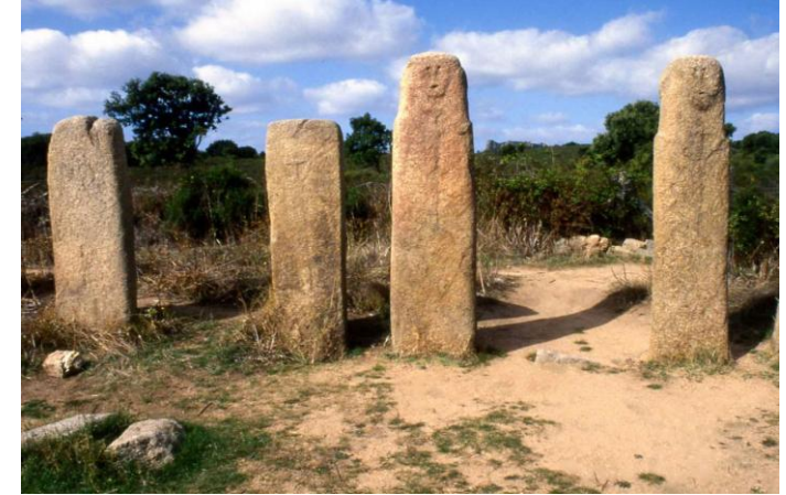
Menhir statues of Stantari (Corsica)