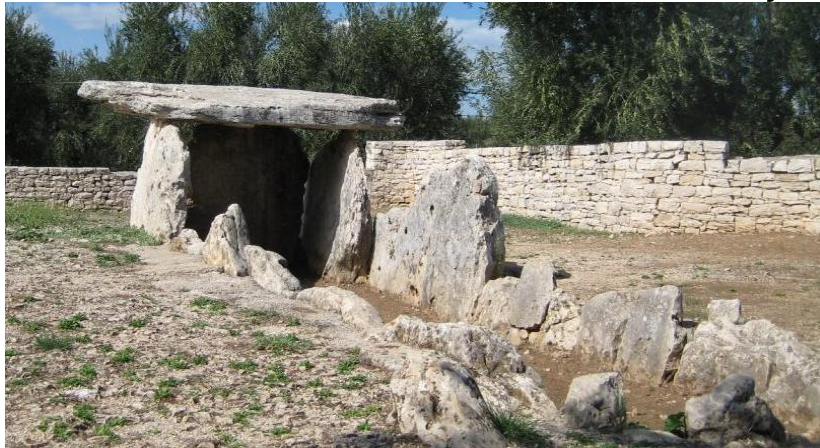
Dolmen La Chianca (Italy)